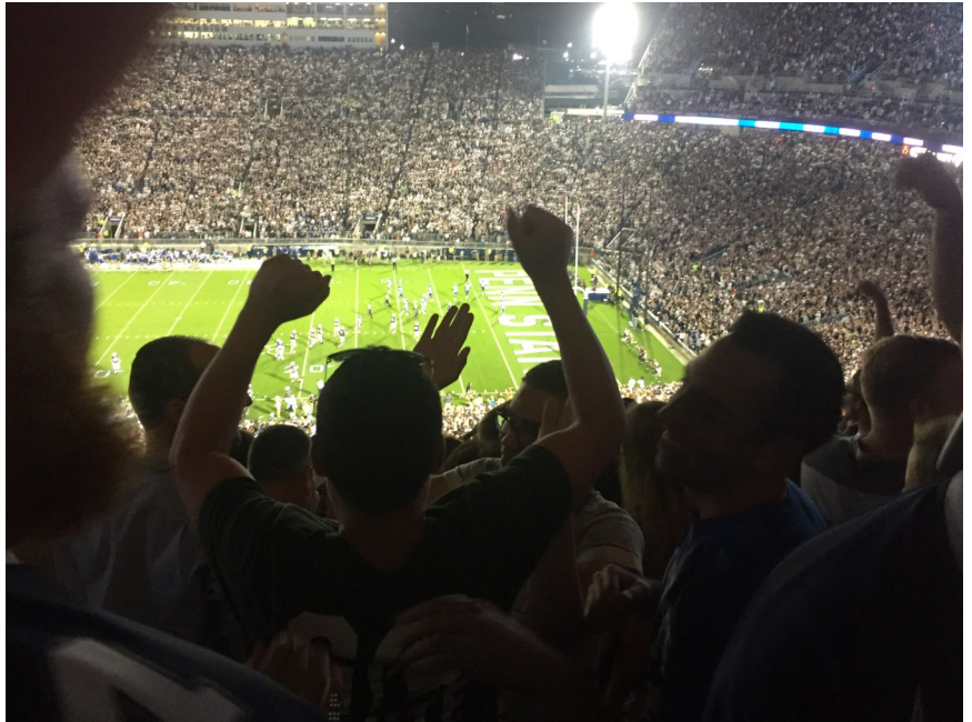
Students celebrate as Penn State scores a touchdown.

"That (throwing people in the air) happens in the student section, but instead of just being one person getting thrown up or two, it's everyone. Just, like, everyone is getting thrown up in the air," Smith explained. "If you're in the student section, everyone is going wild."