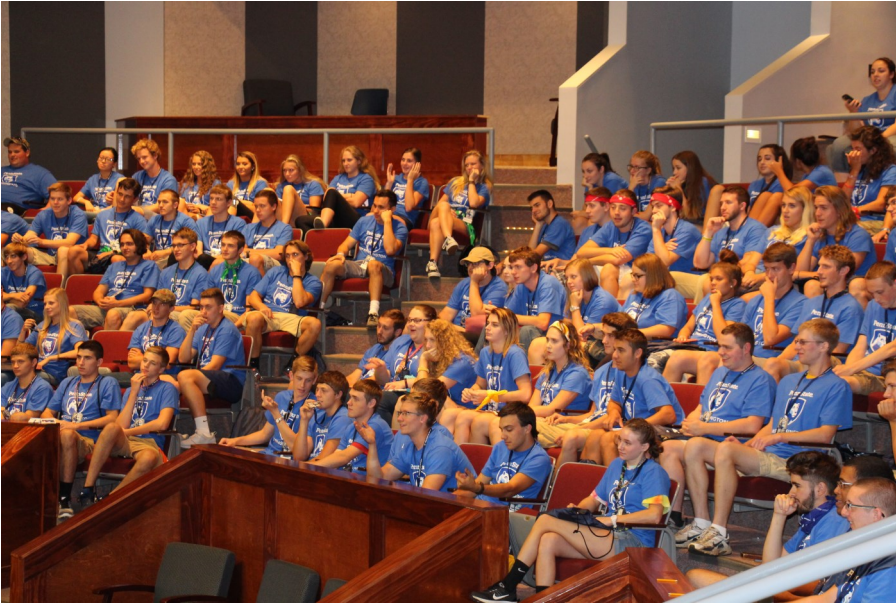
New students gather for the welcome ceremony.