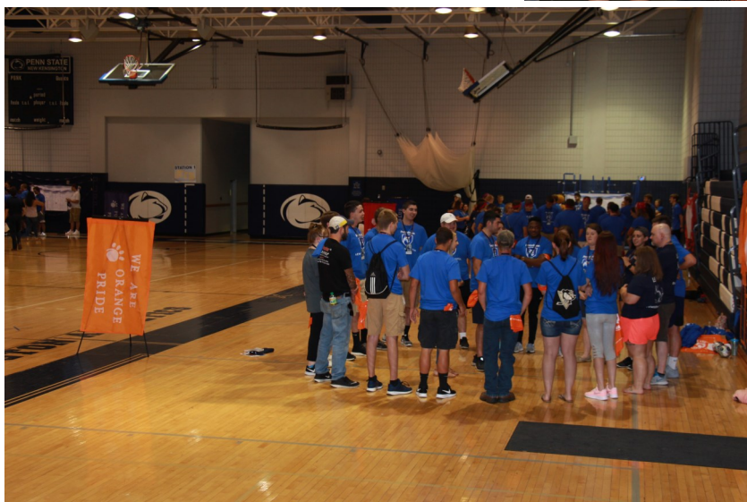
New Students gathered with their leaders.