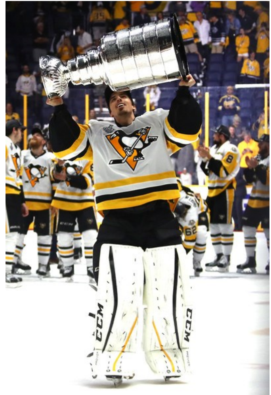
Former Pittsburgh goalie Marc-Andre Fleury raising the Stanley Cup with the Penguins one last time.