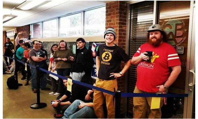
The line for Hamilton tickets

NEW KENSINGTON, Pa.— It’s not often that an off-campus Student Life event creates such a demand that a line forms outside the Student Life Office, which is exactly what happened Jan. 10 when tickets became available to PSNK students for the uber-popular musical “Hamilton,” currently being performed at the Benedum Center in Pittsburgh.