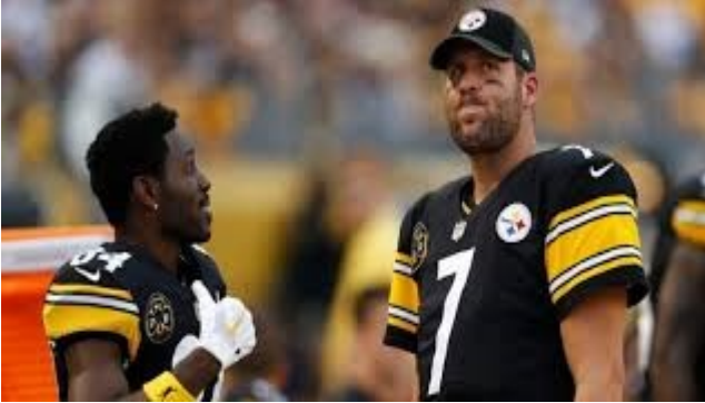
Brown talks to Roethlisberger during a game.