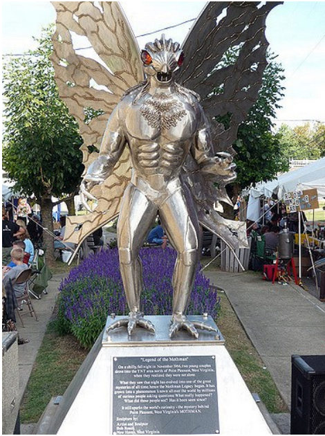
The Mothman statue in Point Pleasant, WV.

Welcome to the first installation of the Nittany Pride's new series: Monster of the Month. In this series, I will give elaborate descriptions of monsters from folklore and legends from all corners of the world. I will provide chilling details of the chaos these monsters created, the terror they reigned, and more. Once I provide enough background on the monster, I will do something extraordinary and obnoxious: I will give my unwanted opinion of the monster and give them a score out of ten. Without further ado, let me introduce our first monster of the month: Mothman.